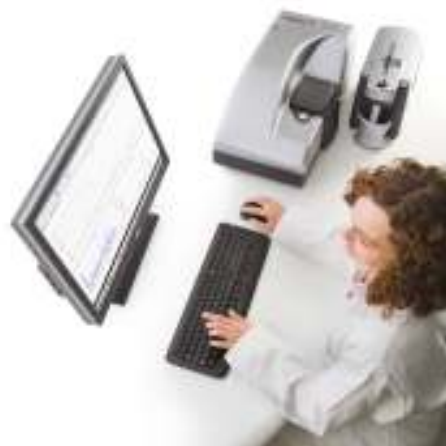
zeta size analyzer