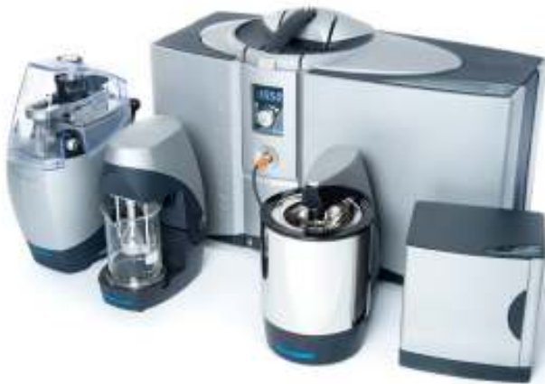
Malvern particle size analyzer