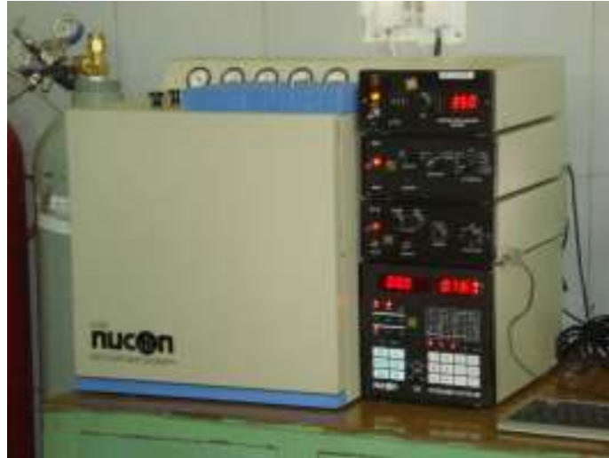
nucon Indian gas chromatograph low cost high quality.